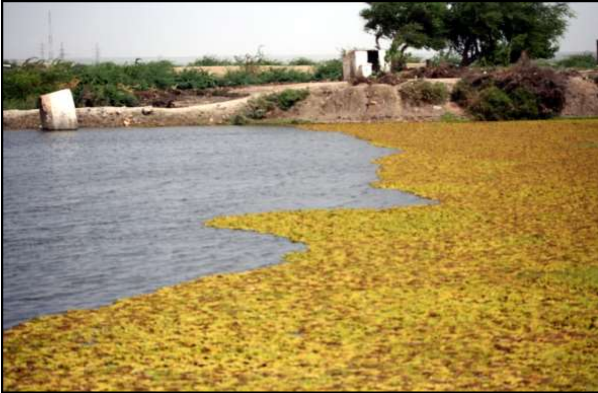
Fig. 1. A view of canal at Ghulam Ullah, water surface covered by Salvinia .