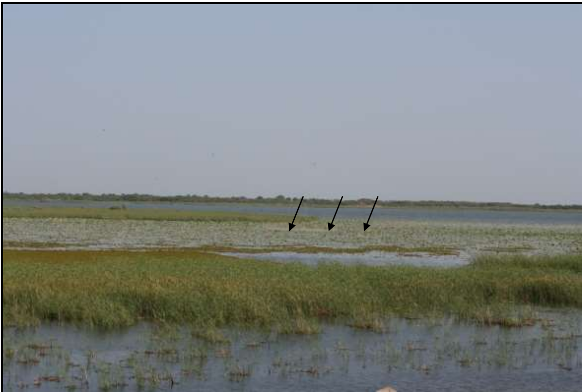
Fig. 2. A view of Keenjhar lake at Jhimpir (↙) shows the propagation of Salvinia which was not present at this margin until 2009.