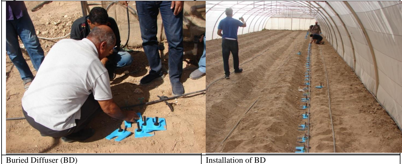
Buried Diffuser (BD)